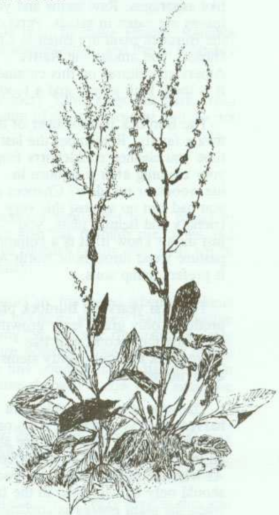
THE SHEEP SORREL PLANT

The entire Sheep Sorrel plant may be harvested to be used in Essiac. Or just the leaves and stems may be harvested, and this allows the plants to be "reharvested" later. The plant portion of the Sheep Sorrel may be harvested throughout the spring, summer, and fall, to be taken early in the morning after the dew has evaporated, or late in the afternoon. Always harvest on a sunny day, as the plants need several days after a rain in which to dry properly. Harvest the leaves and stem before the flowers begin to form, since at this stage, all of the energy of the plant is in the leaves.